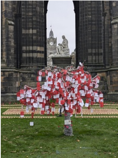
(Scott Monument, Remembrance tree;)

There was ringing for Remembrance across Scotland, with photos and notes at https://www.facebook.com/scottishbellringing