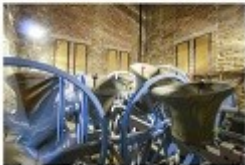
Inveraray's bells sounded on Monday's Bank Holiday to mark King Charles III's coronation.