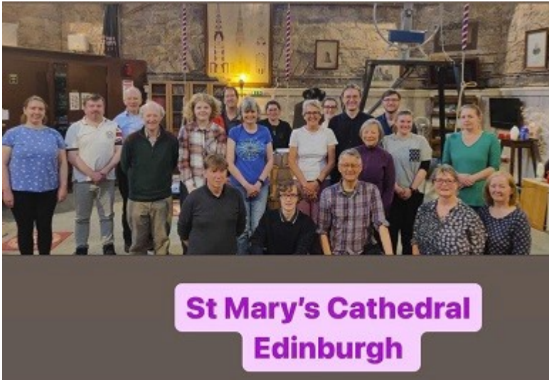
St Mary's Cathedral Edinburgh