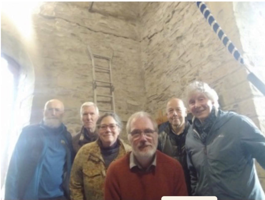
Dunkeld quarter peal band

Handbell-ringing :: The Royal icing on Sunday's ringing following the coronation in Highland was a quarter peal of Kent Treble Bob Royal in hand, with a good set of firsts!