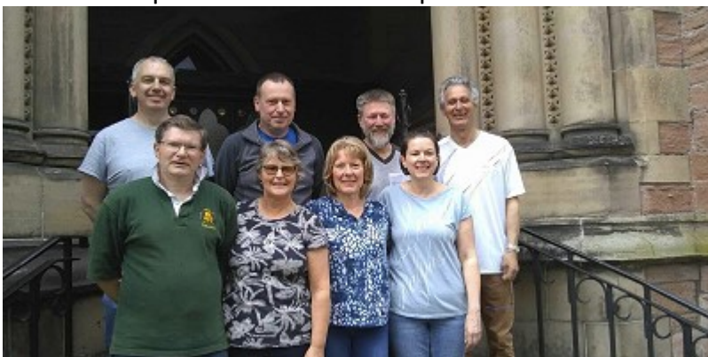
St Andrews :: Stedman and Plain Bob at St Salvator's Chapel