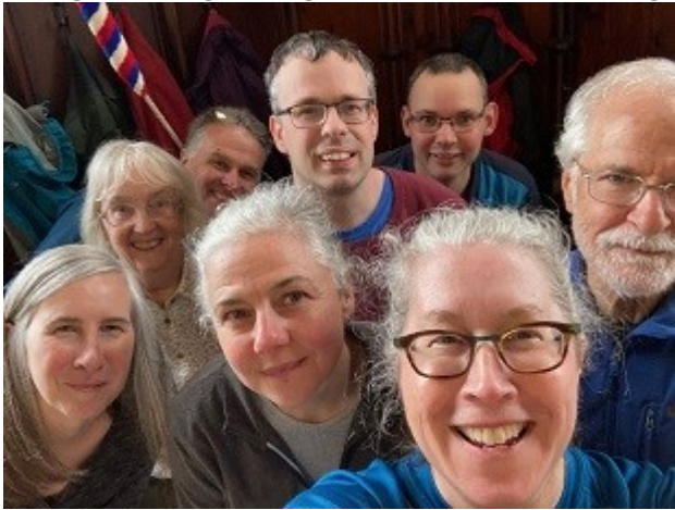
Edinburgh STAGW :: What a great turnout at St Andrew's and St George's West, Edinburgh