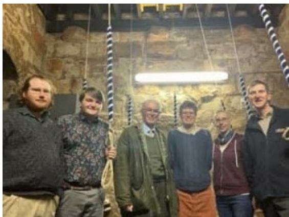
Dundee :: Orb and Sceptre changes were rung at Dundee