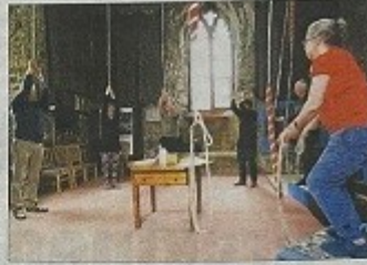
The bell ringers in Inveraray who were hard at work during one of the two quarter-peels on Monday.