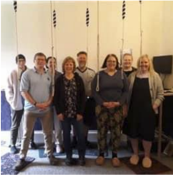
Edinburgh St Cuthbert's :: Royal for the Regal occasion at St Cuthbert's Edinburgh with a peal of Spliced Surprise Royal with London, Bristol, Cambridge and Yorkshire