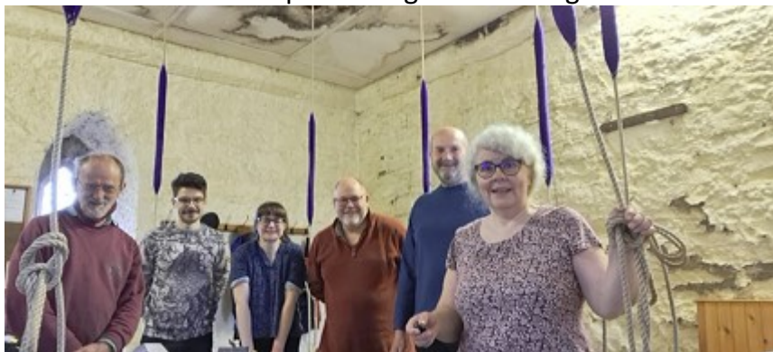
Haddington :: Here's a photo of the band at St Marys Church Haddington for Saturday's general ringing for the coronation.