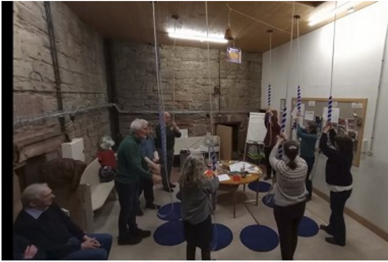
Glasgow :: A glowing band after 5152 changes of Bristol Surprise Major at St Mary's Glasgow