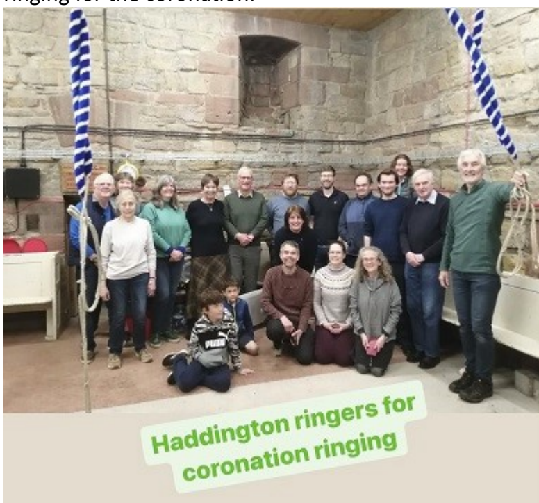
Highlands :: With four coronation quarters – including Royal in hand – and a big turnout for general ringing, it was a great weekend for ringing in the Highlands. And it seems that everyone enjoyed it immensely!