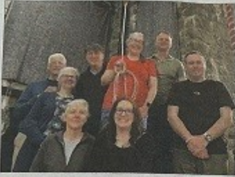
The bell-ringing crew taking a rest in Inveraray.