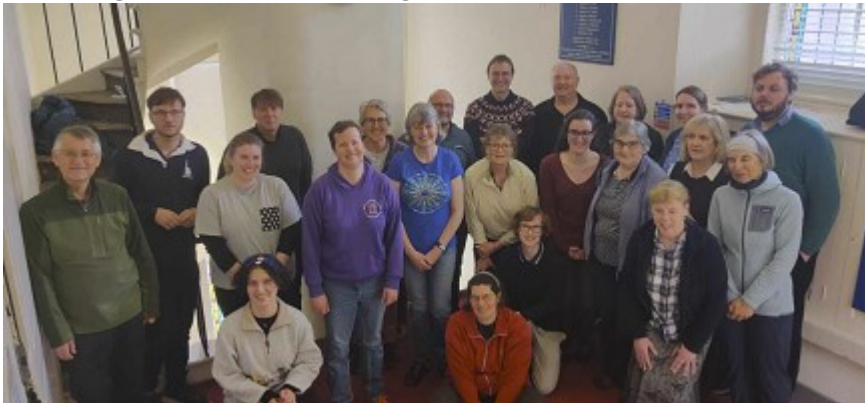
Dunblane :: Firing the bells at Dunblane to celebrate the coronation