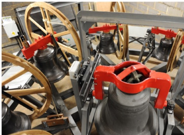
NEW PEAL OF EIGHT IN RADIAL FRAME TOGETHER WITH ELECTRICALLY SWUNG BOURDON AND STATIONARY SERVICE BELL, SOUTH OCKENDON.